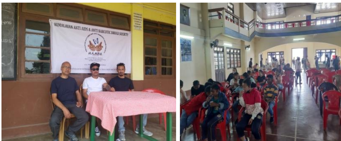
Team H.A.N.D.S.'s counter at the competition & participants