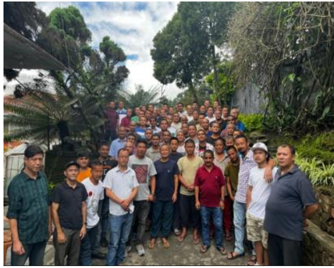
Patients and Staff of H.A.N.D.S. on Independence Day, 2022