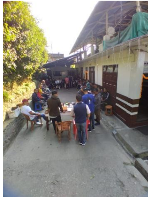
Diwali preparation during the daytime