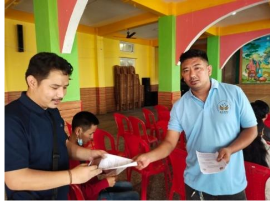
H.A.N.D.S. staff conducting the awareness program