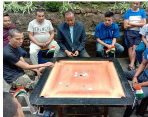
Patients and Staff at Independence Day Parade and celebrations