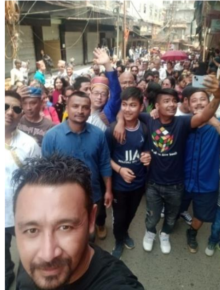
H.A.N.D.S.'s staff member, in-house patients and follow-up patients at the New Year's Rally