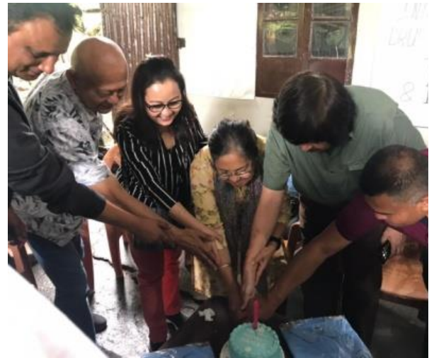
Board Members attending the program at the Rehabilitation Centre