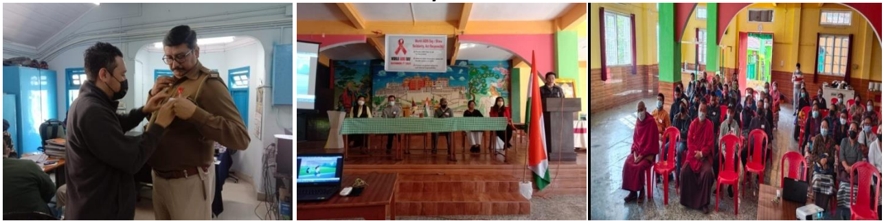
HANDS Staff at Kalimpong Police Station and at the program with Tibetan youth

Like every year, HANDS does not let go of any opportunity in reaching out to the masses and bringing about help, support and solution. World AIDS day has been exactly one of these international events where the staff and volunteers go out to various officials like the Municipality Chairman, Police Department Officer In charge and the masses, ask two minutes of their time and pass the message of HIV/AIDS and its mode of transmission to each one of them. Along with the above program HANDS in association with all India Tibetan Youth forum conducted a program to sensitize the Tibetan community on the relevance of Substance Abuse and HIV/AIDS.