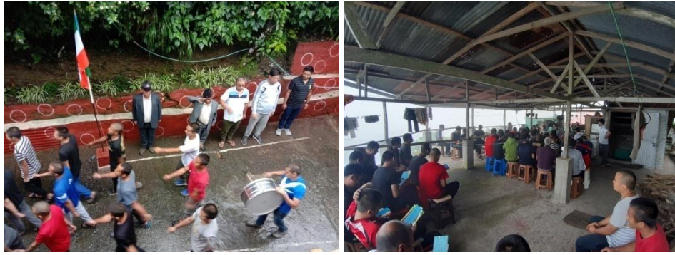
March-past at the Rehabilitation Centre and the patients enjoying games

With the intention of inculcating a sense of patriotism and a sense of contributing to the nation HANDS celebrated Independence Day in its own humble capacity by starting off the day with a parade and a speech on the contribution of the freedom fighters of our country. The patients saluted the tricolor after slogans of “Vande Mataram” and singing the national anthem. The patients sang solo and group songs to arouse the feeling of patriotism. There were indoor games too for their entertainment.