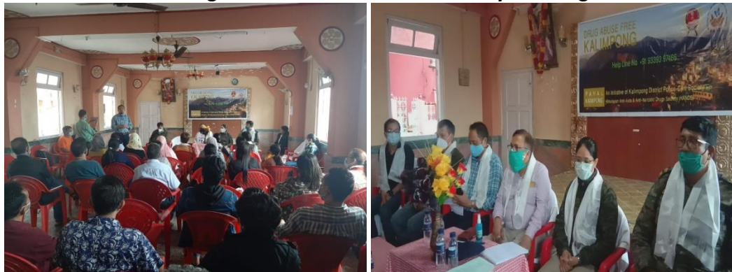
Kalimpong Police Department along with HANDS members at the awareness

With ongoing programs of PAHAL Kalimpong, the team of HANDS along with inspector in charge of Kalimpong Police station and his team assisted HANDS members in conducting a successful program to the entire community people of Thakur Bari. The women folk in particular were very keen on learning to tackle the horrors of substance abuse in their homes and neighborhood.