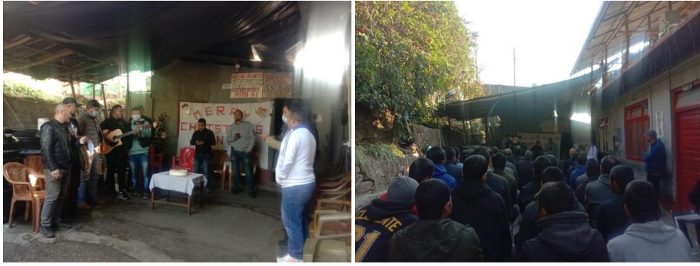
Young Kalimpong Chapter CMA Members celebrating with the patients

Every Year Young CMA Members of Kalimpong Chapter take out time on Christmas morning to come and celebrate Christmas with the patients and staff of HANDS Rehabilitation Centre giving the patients a sense of warmth and acceptance on such festive occasions.