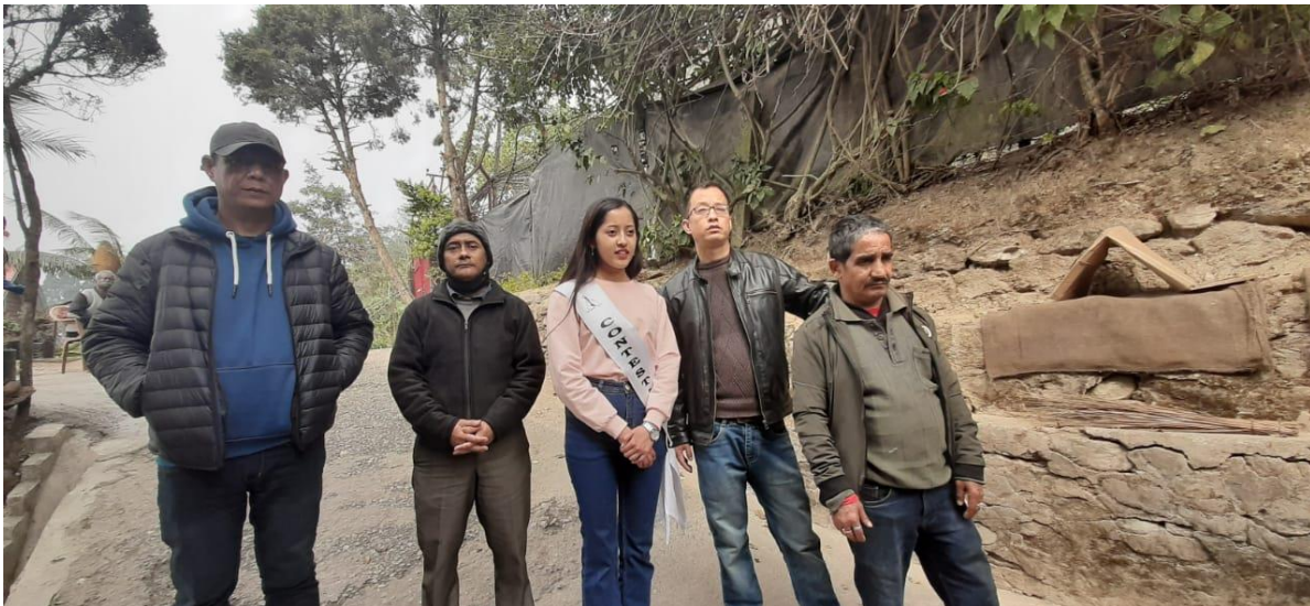
2021 Kalimpong College Beauty Pageant Winner with HANDS staff

HANDS has always looked for new faces amongst the locals who can connect with the common masses and spread key awareness information in general. HANDS got an opportunity to work with students of Kalimpong College who were participating at the Kalimpong College Beauty Pageant 2021. The theme of this years pageant was substance abuse and HANDS helped all the student contestants understand this social ill, document it, what treatment HANDS provide, the efficacy of it, and so on. The documentary that the contestants had made was showcased on the final day of the pageant and also broadcasted on local Kalimpong channels, which had a mass outreach given the high viewership for the pageant and pageant winner.