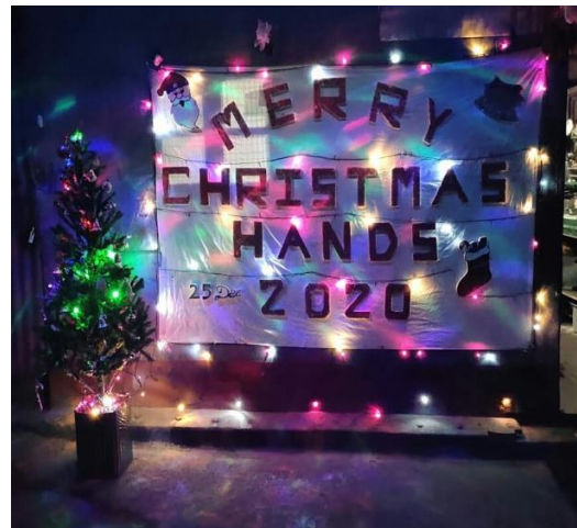
Christmas decor made by the patients