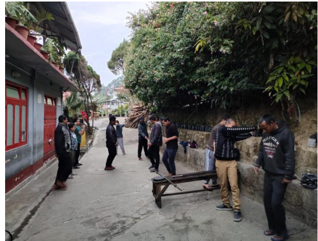
Jugad-gym of the patients