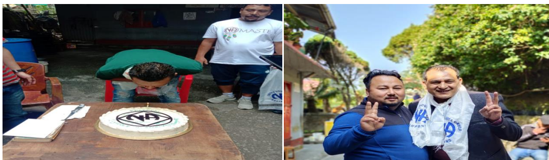
Sober birthday celebration of past patients

Another key HANDS activity is the celebration of sober birthdays of patients who have recovered well and have remained off any kind of substance use/abuse. We celebrate this as a successful milestone in the patients journey towards full recovery; and invite our past patients for a cake cutting ceremony followed by a good lunch. But there is much more to this. We celebrate these success stories to motivate and show our in-patients that staying clean of substance is possible, being productive and living a normal life is possible, being full-functioning members of the society is possible, integrating back into the society, community and most importantly their families is possible. We show our patients that they too can overcome their recovery processes and walk toward the path of healing, free from substance use.