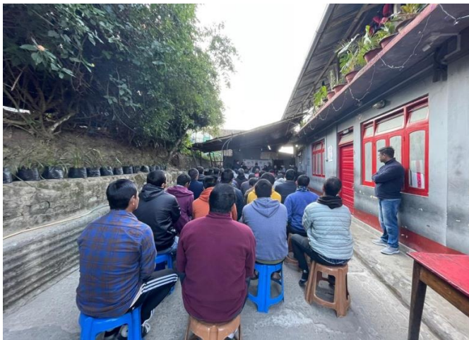
Patients at the rehabilitation centre listening to the CMA members