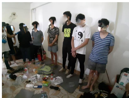
The young boys into substance use in 7 th Mile

HANDS in association with Milan Club members of 7 th Mile, Kalimpong conducted an urgent intervention and awareness day program on the 5 th of July 2020. The residents of 7 th Mile, specially some of the concerned youth had major grievances of instances of drug abuse in their community, due to which, they had requested HANDS to urgently intervene. Seven young boys were given intensive awareness counselling on that day as they were found to be in possession of substances the same day. HANDS intervened and motivated them to seek help. Two of the seven boys then joined HANDS for rehabilitation and are well on their path of recovery.