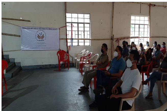
Local youth of Kalijhora