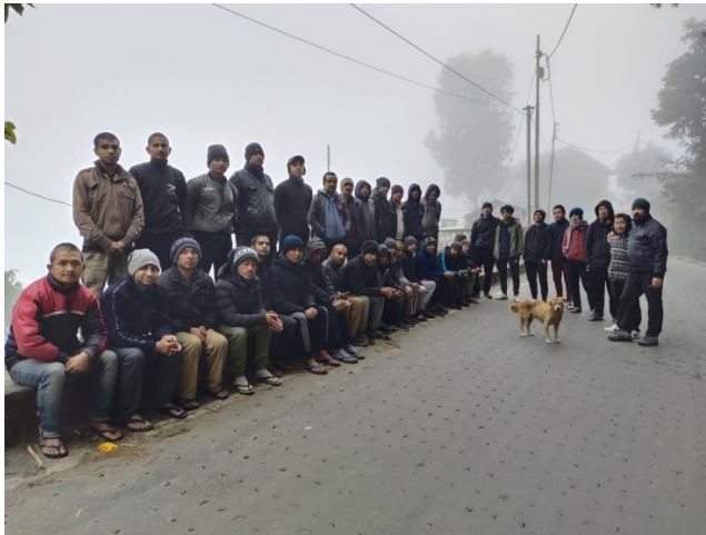
Supervised morning walks of the patients

Apart from the regular classes/sessions at the rehabilitation centre such as group discussions, personal counselling, reading and writing that have been designed for patients, HANDS also added a few activities for the patients as a part of their recreations during these pressing Covid times such as patient-group-walks, supervised outings, vegetable gardening, gyming, and exercising for them to channel their energy and minds into their recovery.