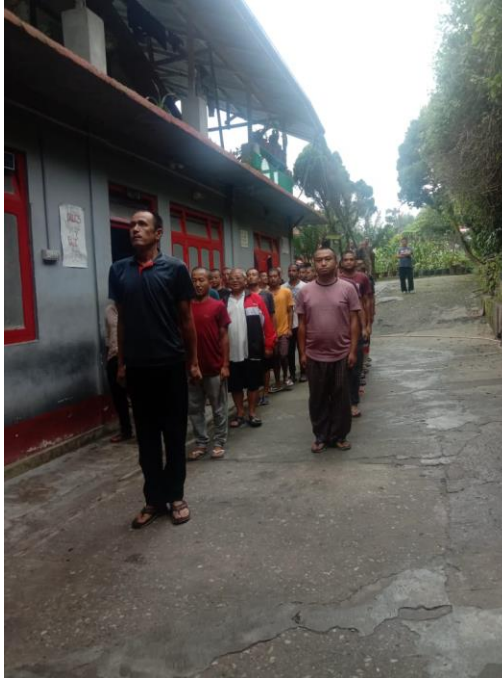
Patients in their “attention” position

Independence Day celebration is one of the most awaited celebrations of the year. This is because in Kalimpong, this day is celebrated by the public, school and college students including administrations with great pride, pomp and show. So patients in the rehabilitation centre looks forward to celebrating this day and we at HANDS try our best to make this day as entertaining and fun as possible for our patients and staff members. Not to let the patients miss what's happening in the world outside the rehab, we started the day as usual with marchpast for which our patients had been practicing for weeks. This was followed by flag hoisting and a day full of indoor games and sports in the form of mini tournaments such as carrom board, chess and tambolas. A special lunch is prepared for our patients and staffs on this day