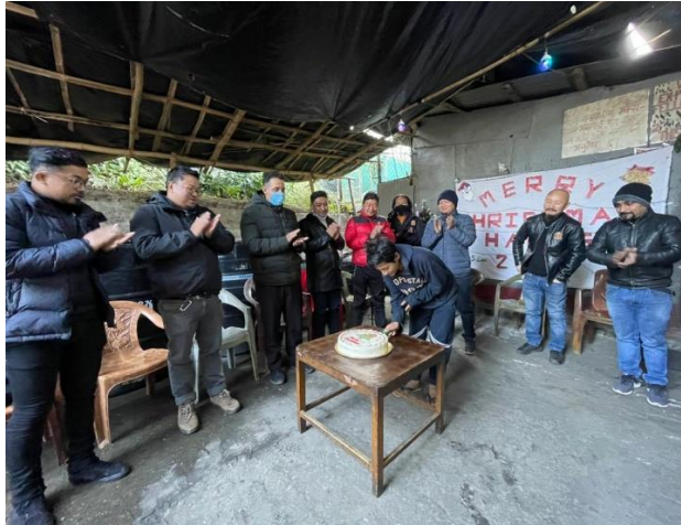
CMA members and an inhouse patient cutting the Christmas cake

making the environment in the rehabilitation centre very lively. The purpose of such visits is also to motivate the patients into believing that there is a life, fun and happiness without drug use.