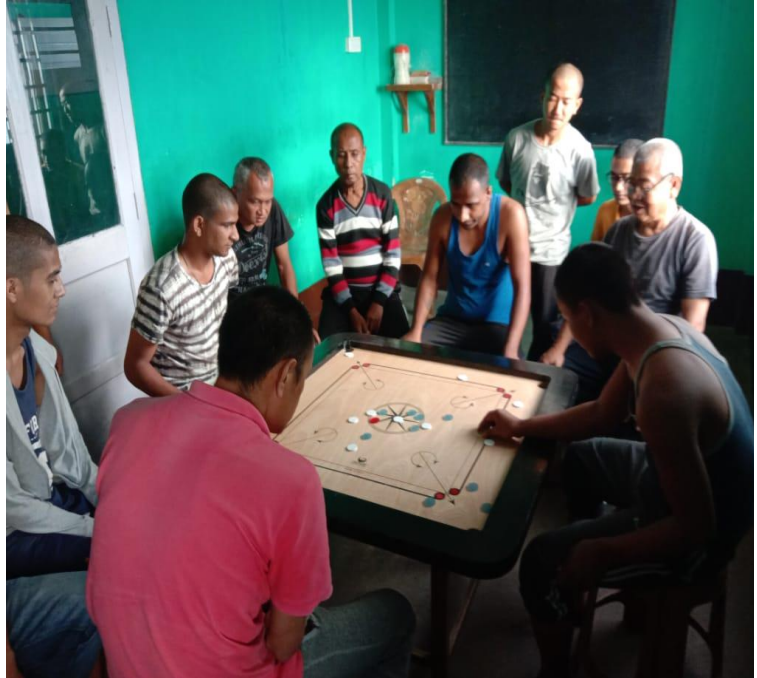
Carrom board tournament