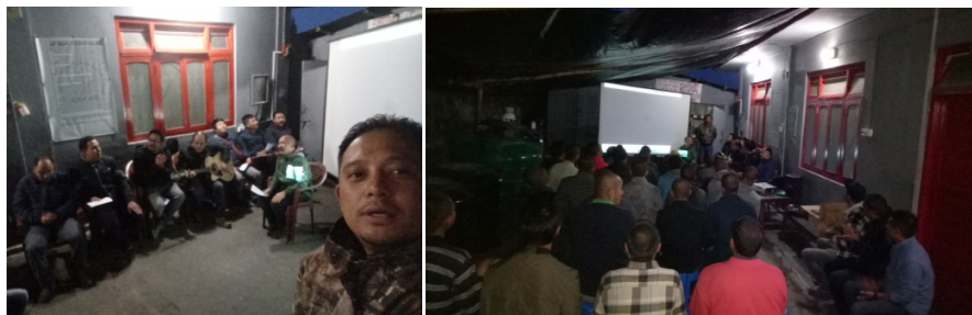
CMA members with the staff and patients in the rehabilitation centre

With the notion of making the patients understand the spiritual side of all religions CMA (Christian Motorcyclists Association), a group of young dedicated Christians on motorcycles celebrated Easter with the patients.