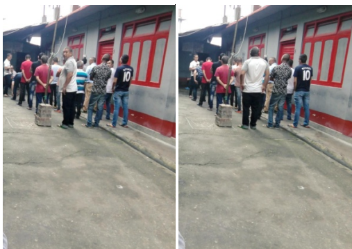
Patients parading and saluting the national flag

As the ultimate goal of every patient in the rehabilitation center is to be a responsible and productive member of the society and nation at large the Rehabilitation Center observes national events like Independence Day and Republic Day in full force only to inculcate a sense of patriotism and responsibility towards his family and nation