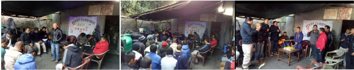
CMA Members celebrating with the patients in the Rehabilitation centre

In making every patient a responsible family member and respecting the social/religious beliefs of his family, HANDS celebrates Christmas and this time too, young members of the Christian Motorcyclist Association were kind enough to conduct the celebrations.