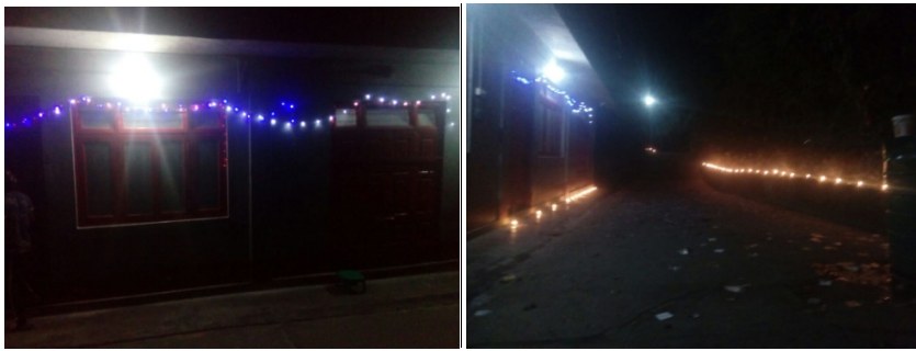
The Rehabilitation Centre light up with Diyas and lights for the celebration

To make one feel at home and learn to celebrate festivals happily without the use of substance and Alcohol, HANDS celebrates festivals in the Rehabilitation with all merry making and dance