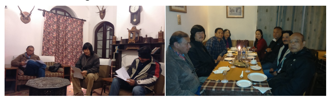
Committee members at one of the several committee meetings

The Committee Members keep meeting on a regular basis for brain storming sessions, seeking ways and means to run the organization in a more effective manner and also finding appropriate channels in reaching out to the society at large.