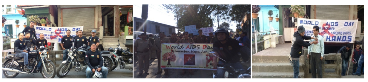
HANDS along with the Local administration and other organizations like C.M.A at the World Aids Day Program

Acknowledging the importance of this international day HANDS participated in a program organized collectively by NGOs of Kalimpong. The program started with a rally around town lead by the ASP and officers of Kalimpong police station, followed by members of Christian Motorcyclist Association, HANDS and various other organizations. The program ended with the