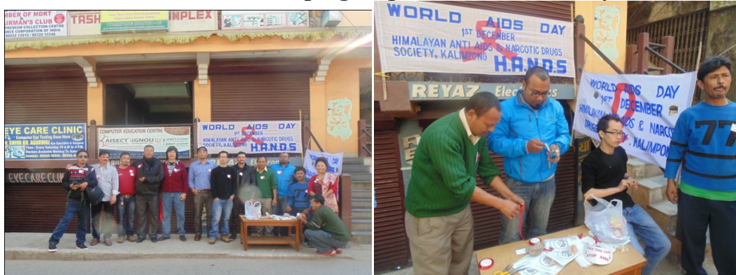
Members, staff & volunteers participating in the street campaign

HANDS never missed out on commemorating international events like World Aids Day. This year HANDS took it to the streets in order to reach out to the common man on a one on one basis, trying to break the denial that our community was free and safe from this disease. Members served as foot soulders stopping people and requesting two minutes of their time in order to jolt them to reality that all is vulnerable to this disease provided we all know how to take correct precautionary measures.