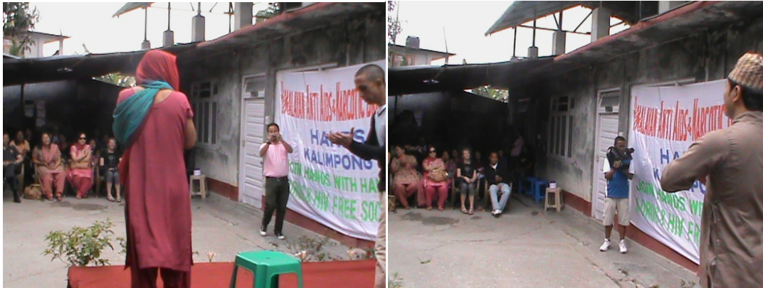
Patients acting and dancing to commemorate the celebration