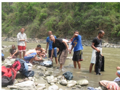
Patients having a Splash