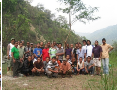
Staff & Patients