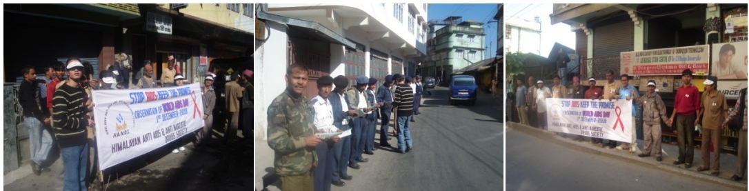
Staff, Volunteers and general public participating in the Human Chain

World AIDS Day (1<sup>st</sup> Dec 08): HANDS along with rest of the NGO's in KPG took part in forming a human chain in the Town.